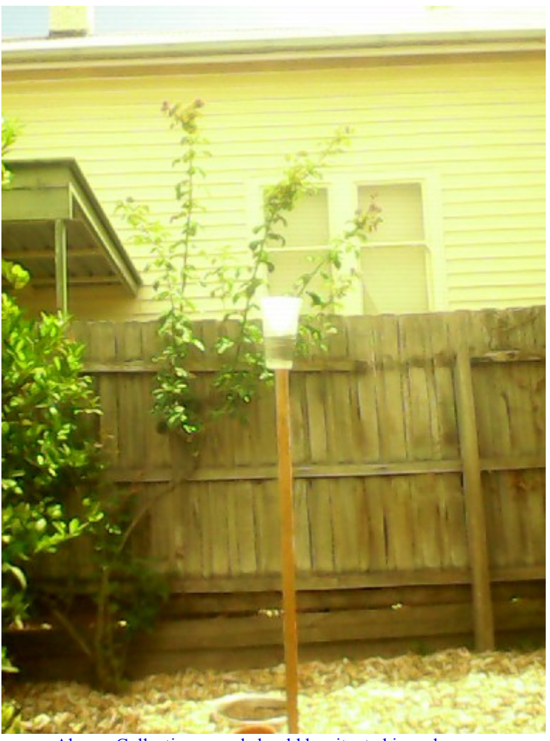
Above: Collection vessel should be situated in a clear space